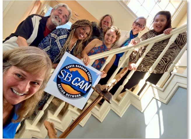
North County “Looking Forward” Awards June 27, 2021