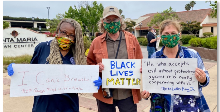
George Floyd Memorial May 31, 2020

In 2001, a group of community activists and leaders came together to discuss the future of Santa Barbara County. This group came to the consensus that although there were numerous local organizations and activists working on a wide range of progressive causes in the south county, their efforts were often fragmented and sometimes working at cross purposes. There was also little representation of the progressive point of view in the north county. There was a clear need for a countywide organization that could bridge the gap between environmental and social justice issues and between the north and south county.