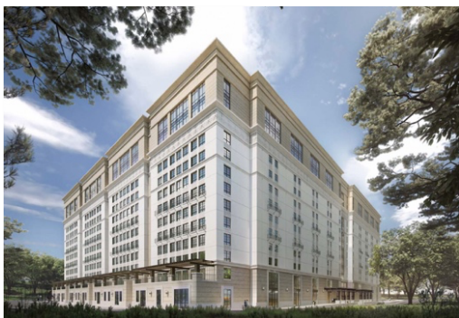
UCSB Munger Hall conceptual rendition

The Sustainable University Now (SUN) Coalition , which SBCAN leads, has been pressuring UCSB to respond to our concerns about the lack of housing for students and the violation of their long-range development plan.