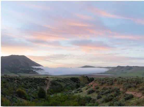
Twitchell Reservoir March 17, 2021

At the last Planning Commission hearing in 2021, commissioners postponed the project indefinitely to give the developer more time to come up with a new design. We will be keeping an eye on this project in the coming months.