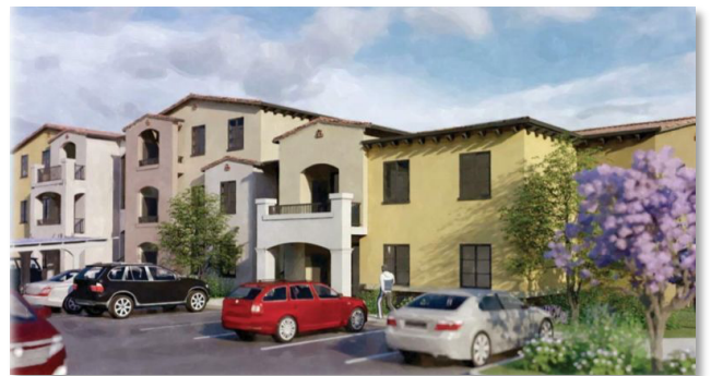
Centennial Gardens conceptual rendition

On several occasions, SBCAN has been one of few – or in some cases the sole – voice speaking in favor of affordable housing projects in Santa Maria . Some of the projects we supported in 2021 were the Centennial Gardens project and People's Self-Help Housing project at the Hi-Way Drive In, which is still in the process of getting approved.