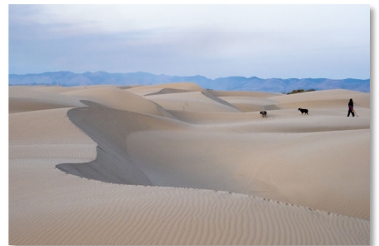
Guadalupe-Nipomo Dunes Oct. 19, 2021

We also have opposed the leapfrog luxury housing project in Orcutt known as the Neighborhoods at Hidden Canyon and Willow Creek . As proposed, this project would have unavoidable and significant impacts to wildlife and would have not have any affordable units.