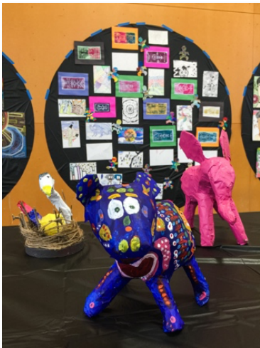
Youth Arts Alive July 13, 2018

expanding public transportation. SBCAN immediately made an impact as our executive director began speaking up at nearly all county Board of Supervisor's hearings. This was especially important in the North County where the progressive point of view often went unheard.